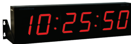
[DDU-TM] - IP20