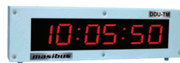
[DDU-TM] - IP65